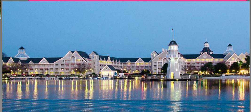
Disney's Yacht Club Resort